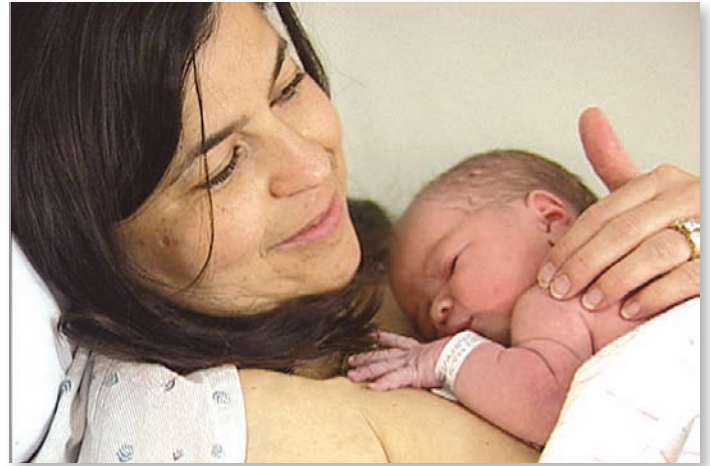
In most cases, your baby gets everything she needs when you hold her skin to skin.

baby's nose and mouth, giving routine medications, or taking the baby to the warmer for observation can be delayed, performed while baby is skin to skin, or avoided altogether.