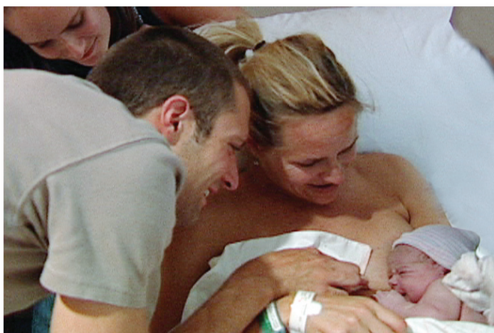
The Six Lamaze Healthy Birth Practices can help you have a safer and healthier birth.

Let's face it—birth isn't easy. Many mothers proudly claim it is the most challenging work they have ever accomplished. But the truth is you have everything you need to accomplish this everyday miracle.