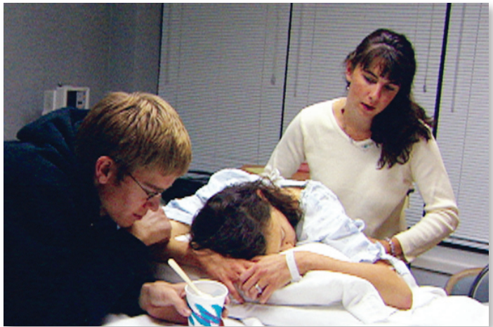
Doulas work in cooperation with other support people to provide continuous hands-on support.