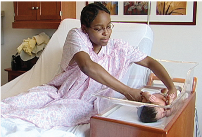
Rooming-in with your baby makes it easier for you to respond to her needs.

But research shows that you are likely to get just as much sleep with your baby in your room as you would if your baby were in the nursery. Research also tells us that babies who go to the hospital nursery at night cry more and are more likely to have trouble breastfeeding than babies who room-in with their mothers.