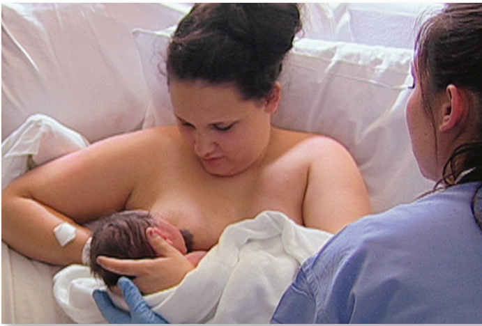
Holding your baby skin to skin naturally supports breastfeeding.