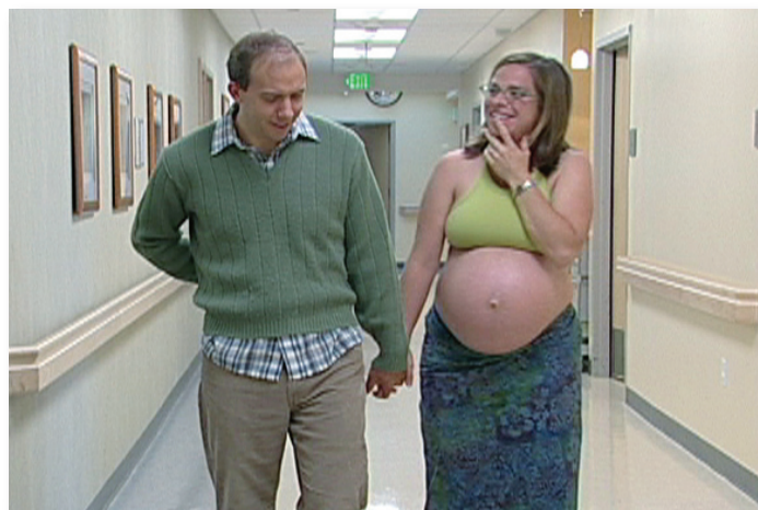
Walking during early labor helps keep labor moving.

One position that is rarely comfortable and may be unsafe for your baby is lying flat on your back. In this position, the blood vessels that bring oxygen to your baby can be compressed, and your baby may show signs of distress.